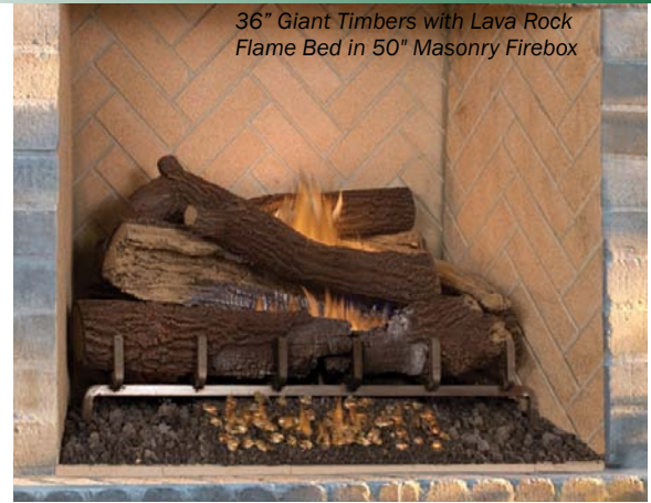
36" Giant Timbers with Lava Rock Flame Bed in 50" Masonry Firebox

Designed to fit the larger fireboxes of today! 24" log sets are designed for 36" fireboxes, 30" log sets for 42" fireboxes and 36" log sets for 48" fireboxes and larger masonry units.