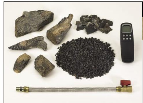
Standard feature components include hand-held, multi-function remote control