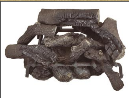
Solid, unitized log arrangement is intricately detailed.

Design Dynamics goes above and beyond when it comes to safety of our products. In addition to industry-leading, clean flame combustion technology, the Hardwood includes a millivolt safety gas control with multi-function remote, and matchless, piezo ignition. The control and gas train are 100% factory assembled and tested.